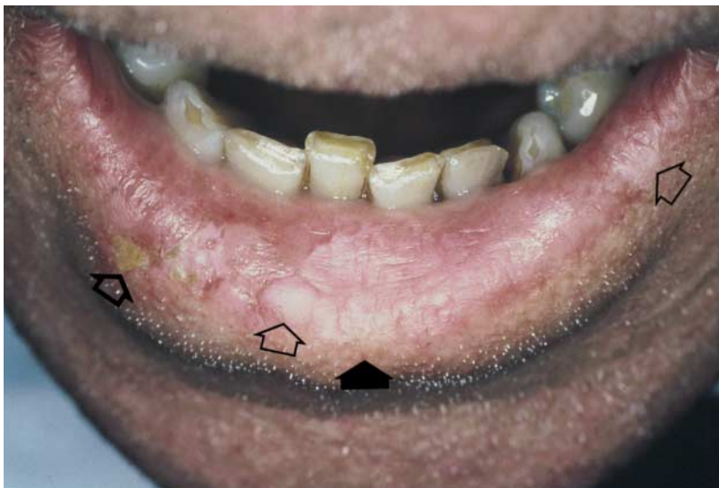
Figure 1. Clinical Features of a Lip Lesion in a Renal-Transplant Recipient.

The differences in sun exposure between the men and women in the renal-transplant group were not significant, but the 13 transplant recipients (all men) who had dysplastic or malignant lesions had significantly more sun exposure than the 147 recipients with normal lips or nondysplastic lesions ( P < 0.001 ). The majority (69 percent) of the men with dysplastic or malignant lesions, including both patients with squamous-cell carcinoma, were in the highest sun-exposure category. More of the transplant recipients with dysplastic or malignant lesions than of the other recipients were smokers ( P = 0.003 ). Both exposure to the sun and a history of smoking were significant independent variables in a logistic-regression analysis ( P = 0.002 and P = 0.009 , respectively); no other variables approached statistical significance. Of the female recipients, 73 percent used lipstick when out of doors; all had done so for 5 years or more and 92 percent for more than 10 years. Although the three white women who had leukoplakia used lipstick, none had dysplastic or malignant lesions.