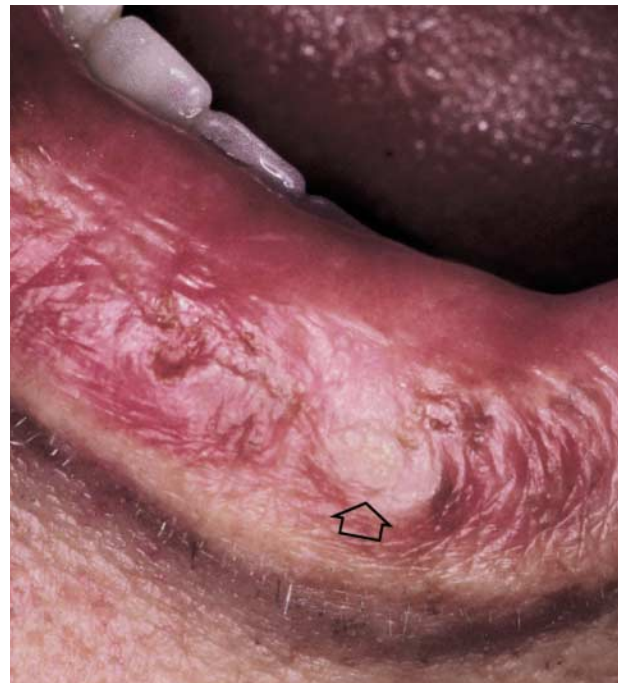
Figure 3. Lower Lip of a 62-Year-Old Male Renal-Transplant Recipient.

The renal-transplant recipients and the controls were matched for age, sex, and skin type, but the renal-transplant group had a generally lower frequency of possible risk factors such as smoking, alcohol consumption, and exposure to the sun. Immunosuppression ap-