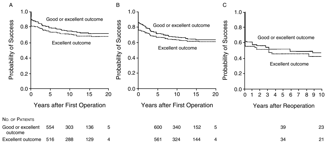
Figure 1. Kaplan-Meier Analysis of the Success of Microvascular Decompression for Trigeminal Neuralgia.

The curves show the proportions of patients with successful outcomes (defined in the text) after the first microvascular decompression only, for all 1185 patients (1204 procedures, Panel A); after one or two microvascular decompression procedures, for all 1185 patients (1336 procedures, Panel B); and after the second operation only, for 132 patients (132 procedures, Panel C). Forty-nine patients with less than a year of follow-up were excluded.