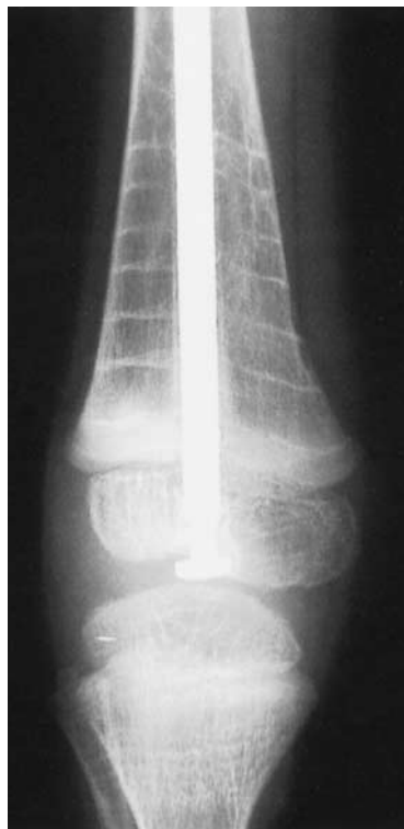
Figure 3. Anteroposterior Radiograph Showing Sclerotic Bands in the Metaphysis of the Distal Femur in an Eight-Year-Old Boy with Osteogenesis Imperfecta.

This child received seven cycles of treatment. The seven evenly spaced bands demonstrate that growth continued steadily during therapy.