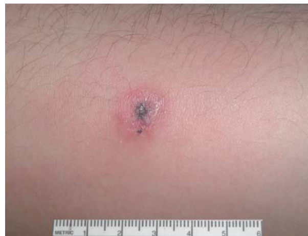
Figure 1. Bacillus anthracis Lesion on the Forearm of the Patient.

Because of current health concern, this letter was published at www.nejm.org on November 8, 2001.