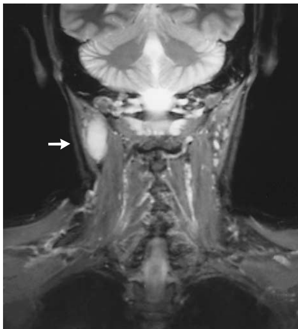
Figure 2. Magnetic Resonance Imaging of the Lymph-Node Mass in the Right Side of the Patient's Neck.

On physical examination, there was a 1.5-cm nontender, erythematous nodule with a central, 0.4-cm black eschar