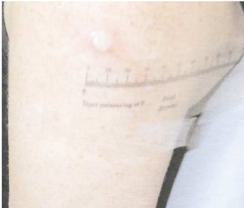
Figure 1. Typical Vesicle on the Upper Arm 10 Days after Scarification.

comparisons of the study groups were made with the use of the Tukey adjustment for multiplicity. All t-tests were two-sided.