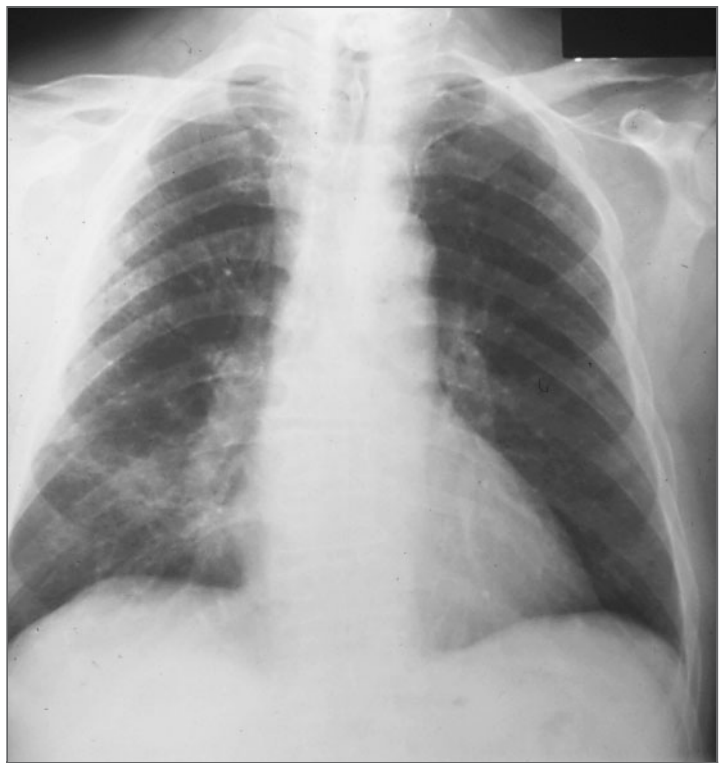
Figure 1. Posteroanterior Chest Radiograph of a 68-Year-Old Patient with Pneumocystis Pneumonia That Developed as a Consequence of Long-Term Corticosteroid Therapy for an Inflammatory Neuropathy.

Medications used to treat pneumocystis pneumonia are listed in Table 2. Trimethoprim-sulfamethoxazole is most effective in treating severe pneumocystis pneumonia. Unfortunately, adverse effects are common, and patients with known allergies to sulfa cannot tolerate this therapy. Corticosteroids are of benefit in HIV-infected patients with pneumocystis pneumonia who have hypoxemia (the partial pressure of arterial oxygen while the patient is breathing room air is under 70 mm Hg or the alveolar-arterial gradient is above 35). Such patients should receive prednisone at a dose of 40 mg twice daily for five days, then 40 mg daily on