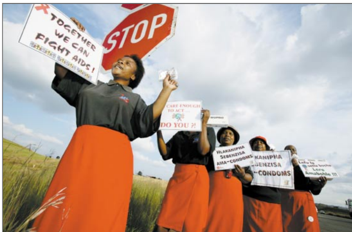
Women Passing out Condoms and Educational Leaflets in the Witbank District, Gauteng Province, South Africa.