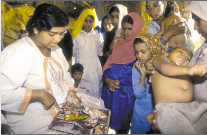
Mobile Health and Family Planning Clinic, Udaka, India.