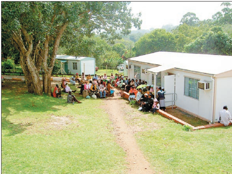
Patients Waiting to Be Seen at the HIV Clinic at Bethesda Hospital in Rural KwaZulu-Natal Province.

Africa has been hit the hardest by the crisis: according to