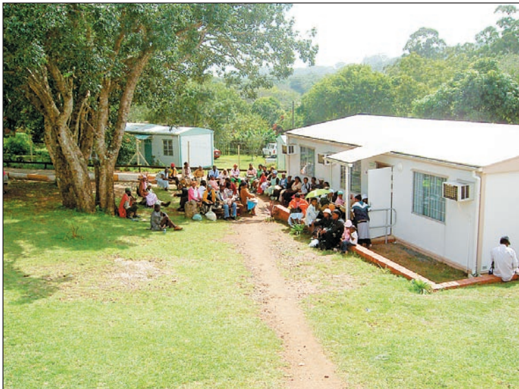
Patients Waiting to Be Seen at the HIV Clinic at Bethesda Hospital in Rural KwaZulu-Natal Province.

Africa has been hit the hardest by the crisis: according to