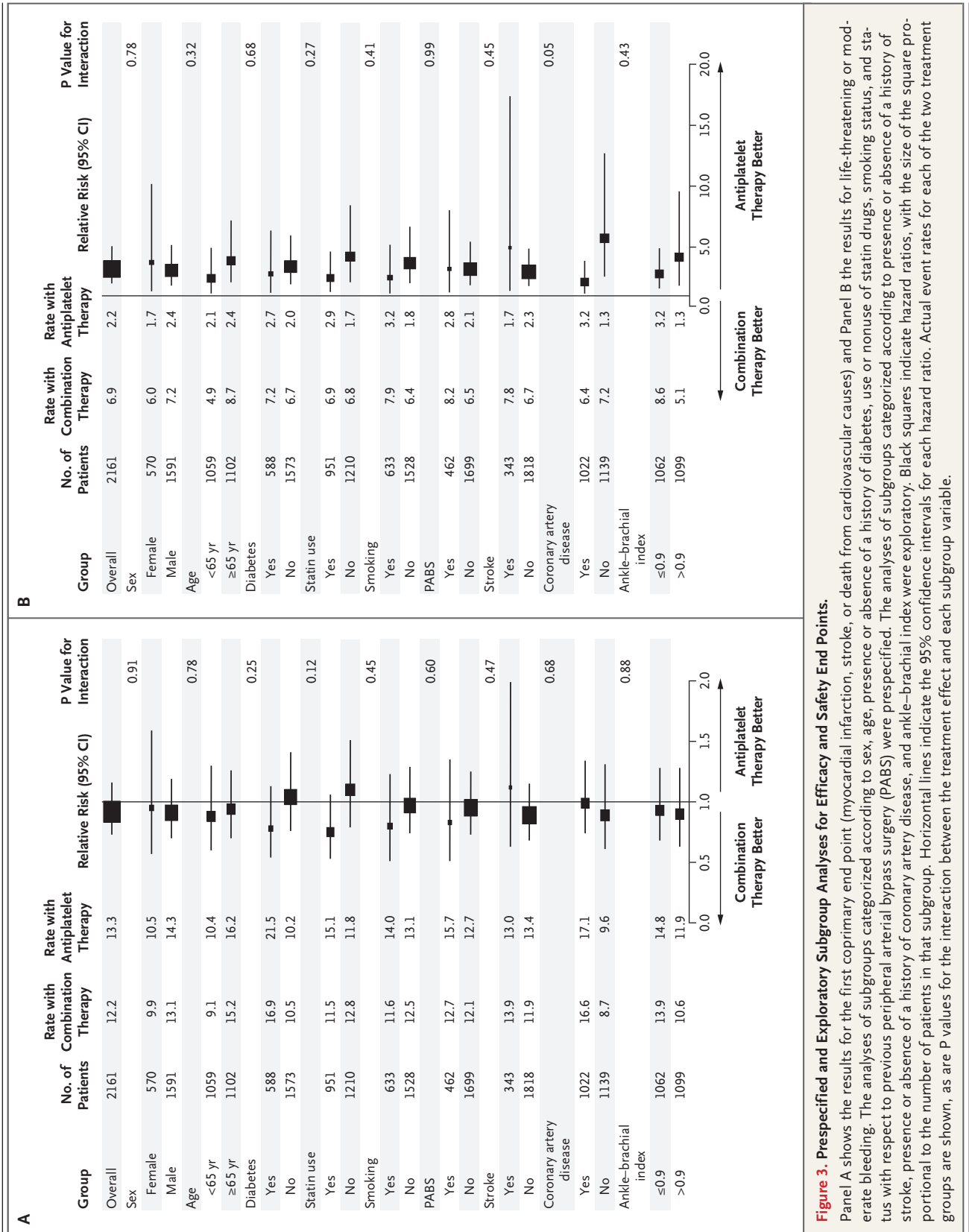
Figure 3. Prespecified and Exploratory Subgroup Analyses for Efficacy and Safety End Points.

Panel A shows the results for the first coprimary end point (myocardial infarction, stroke, or death from cardiovascular causes) and Panel B the results for life-threatening or moderate bleeding. The analyses of subgroups categorized according to sex, age, presence or absence of a history of diabetes, use or nonuse of statin drugs, smoking status, and status with respect to previous peripheral arterial bypass surgery (PABS) were prespecified. The analyses of subgroups categorized according to presence or absence of a history of stroke, presence or absence of a history of coronary artery disease, and ankle-brachial index were exploratory. Black squares indicate hazard ratios, with the size of the square proportional to the number of patients in that subgroup. Horizontal lines indicate the 95% confidence intervals for each hazard ratio. Actual event rates for each of the two treatment groups are shown, as are P values for the interaction between the treatment effect and each subgroup variable.