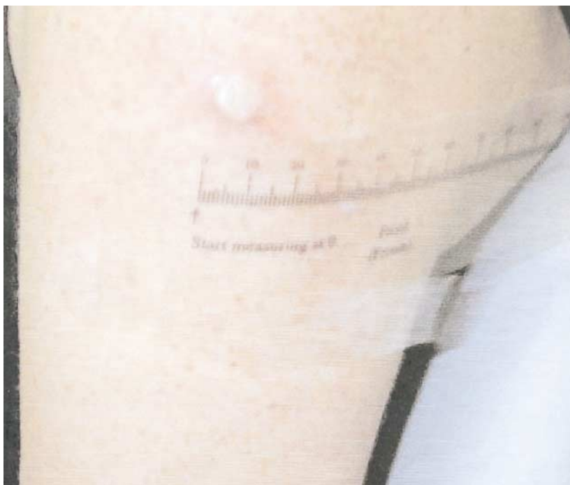
Figure 1. Typical Vesicle on the Upper Arm 10 Days after Scarification.

ject reported a stiff neck on days 12 and 13 after vaccination. One subject reported intermittent dizziness, floaters, and tachycardia starting on day 15 after vaccination and lasting two weeks. One subject had an intermittent rash on the arms and legs and muscle aches on days 9 through 13. Two subjects had an elevated alanine aminotransferase level ( \leq 84 U per liter) on day 28; the elevation resolved two weeks later in one subject and was still present at the time of the last follow-up visit in the other. One subject had a transient, mild decrease in the hemoglobin level (13.4 to 11.7 g per deciliter) on day 28. On urinalysis at six months, one subject transiently had 11 white cells per high-power field. Three subjects reported that the skin around the dressing was irritated. One subject in whom vaccination failed reported myalgias and pain at the vaccination site seven days after vaccination. There were no serious adverse events. One subject who received the 1:100 dilution of vaccine withdrew after vaccination for reasons unrelated to the study. Fifty-five of the subjects provided blood specimens at one year, as planned.