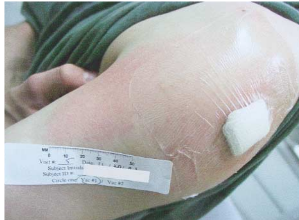
Figure 1. Semipermeable Adhesive Dressing.

The primary end point was the rate of success of vaccination. Success was defined by the presence of a primary vesicle at the inoculation site seven to nine days after scarification, as described previously. 4 To increase the rate of success of vaccination, subjects who had no evidence of vesicle formation by days 7 through 9 were revaccinated between days 7 and 17 with the same dilution of vaccinia virus.