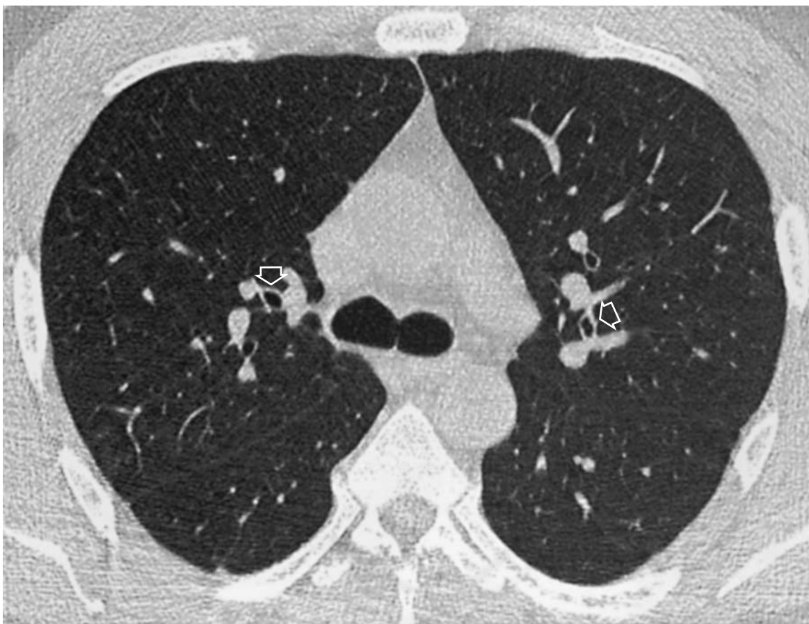
Figure 3. High-Resolution CT Images Obtained in a Firefighter with World Trade Center Cough.

A 1-mm-thick collimated section obtained at the level of the carina in a 40-year-old male firefighter shows thickening of the walls of the bronchi to the upper lobes, which is most pronounced on the left (arrows).